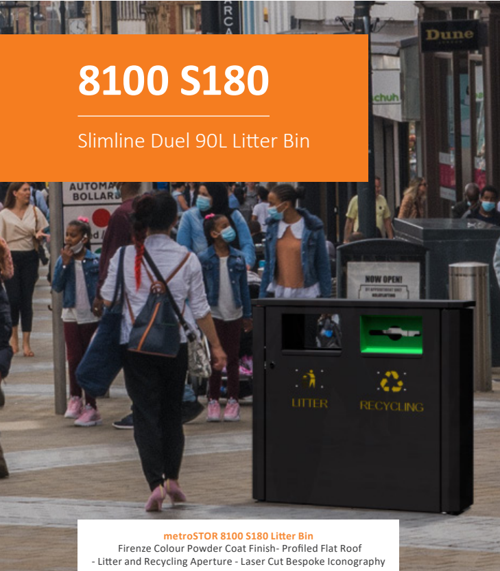
metroSTOR 8100 S180 Litter Bin Firenze Colour Powder Coat Finish- Profiled Flat Roof - Litter and Recycling Aperture - Laser Cut Bespoke Iconography

metroSTOR 8100 S180 the dual bin version of the slimline metroSTOR 8100 Litter Bin, the S180 is also manufactured from galvanised steel, colour powder coated the S180 has a square sided form, four apertures as standard and an integral steel liner.