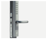
Latch + Battery Code Lock