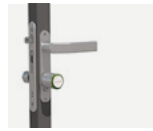
Latch + RFID Lock