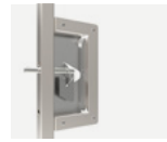
Slide Bolt + Padlock