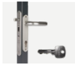
Latch + Eurocylinder Lock