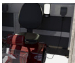
Integral Charging System