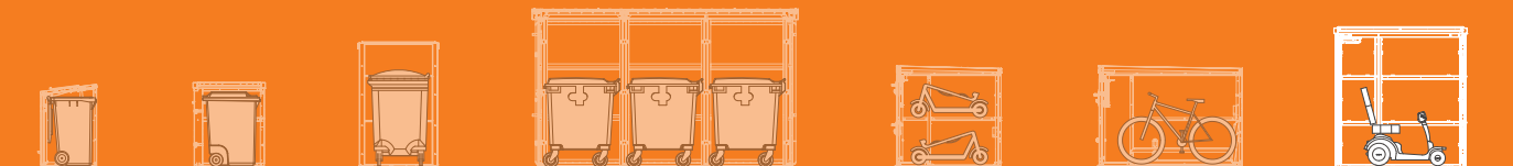
Firenze Colour Powder Coat